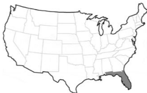
Range maps of the Eurasian collared-dove in the United States (shaded areas indicate a sighting during that time period)

thousands of locations across the United States. Scientists can use these data and the visualization tools built into the website to examine the frequency and abundance of different species of birds at different locations and over time.